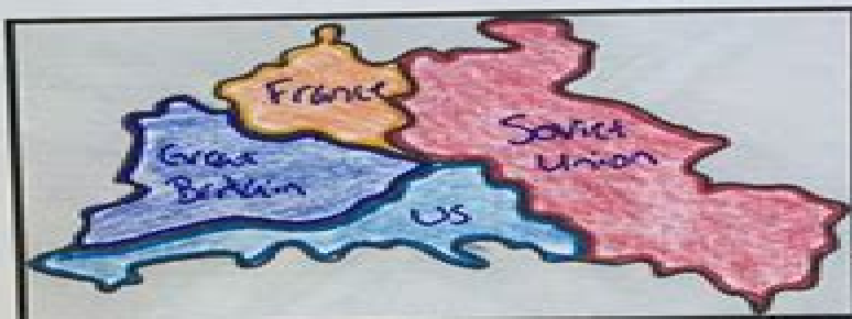
Berlin divided into 4 occupational zones

Label each flag below and then draw lines to the areas or the areas in Germany and Berlin that were occupied by the country.