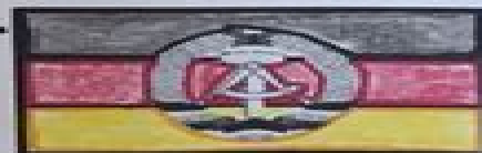
German Democratic Republic