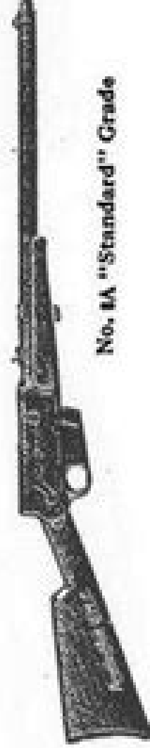
No. 1A "Standard" Grade