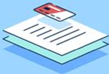
Credit card applications