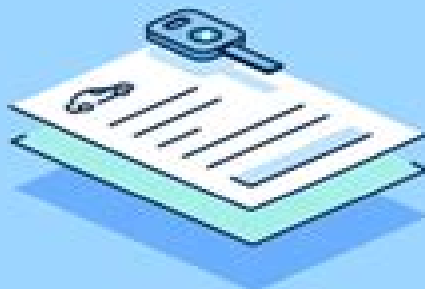
Auto loan applications