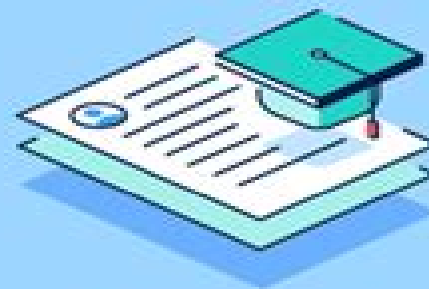
Student loan applications