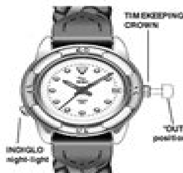
Watch with Separate INDIGLO night-light Push Button