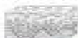
Simple Cuboidal Epithelium

Most abundant of all tissues that cover the body surface.