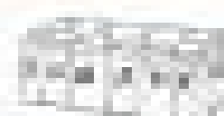
Simple Columnar Epithelium