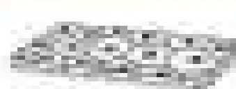
Simple Columnar Epithelium

What is the shape of the epithelial cells? What is the shape of the connective tissue?