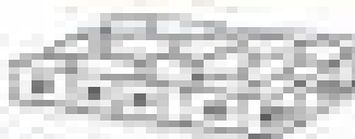
Simple Cuboidal Epithelium