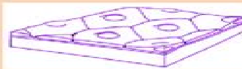
B. Simple squamous epithelium