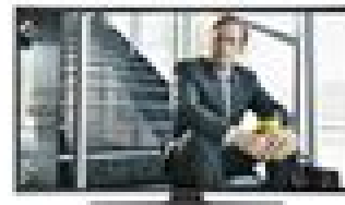
Bedroom #2: TiVo Roamio ®