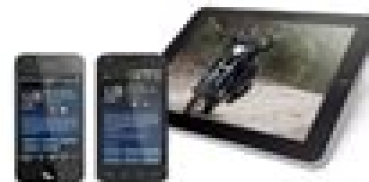
Stream to mobile devices