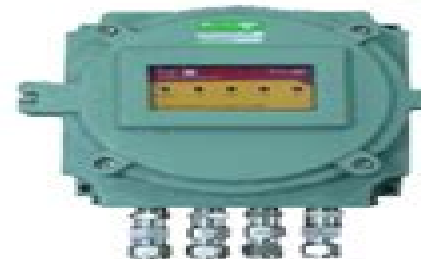
Ex - Proof