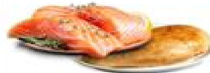
Lean Meat Or Fish