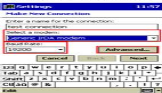
Figure 1. Select a modem and check the Baud Rate (When using HSCSD it is recommended to use 115200). After that tap Advanced...