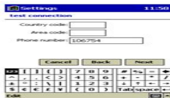
Figure 3. Type in the ISP's phone number (typically in GPRS Connection the ph. number is *99#, please check from your GSM operator) and then tap Next.