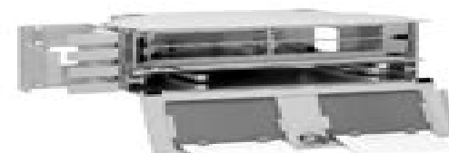
Rack Mount Termination/Splice Panel (Empty)