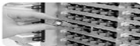
Single Fiber Access

The FL2000 system is a flexible and modular series of fiber products for today's and tomorrow's evolving communications and data networks.