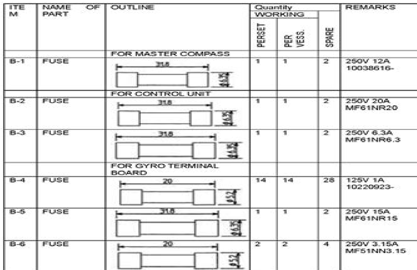
Table 5.3 Spare Parts

Spare parts shown in Table 5-3 are attached to this system.