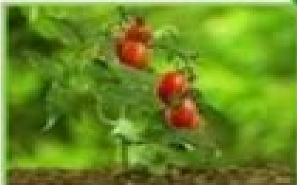
Tomato Plant Life Cycle