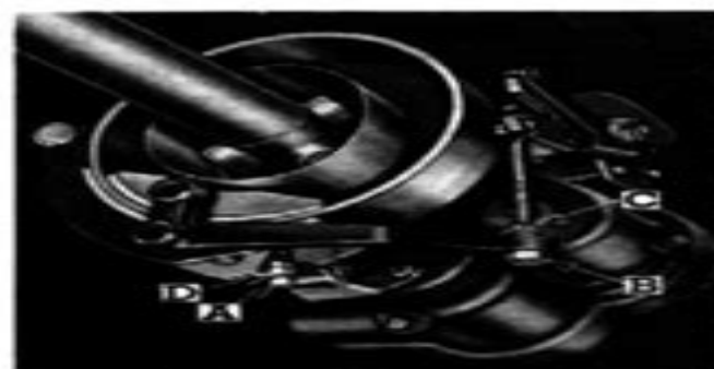
Fig. 57—Propeller Shaft Brake

4. Recheck both facing-to-drum clearances.