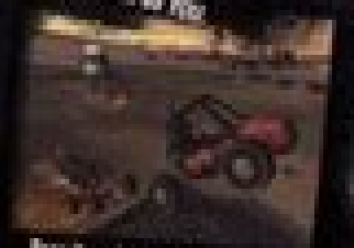
Beat it up in cars or other rides.