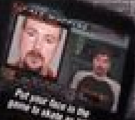
Put your face in the game to skate as THUG.