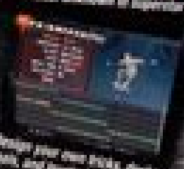
Design your own decks, deck pads, and wheels. It's your game.