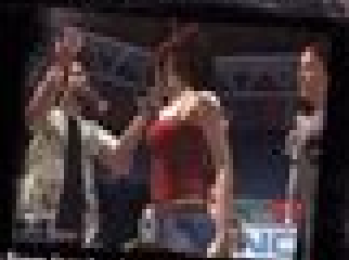
Go from best unknown to superstar status.