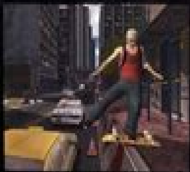
THUG™ stars THUG as a skate punk out to make it big.

This time it's YOUR journey. Break the rules. Beat the odds. Become a Star!