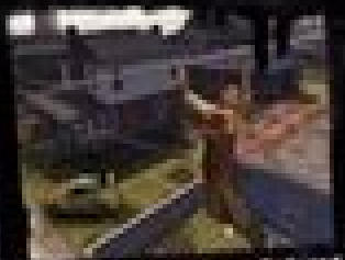
Do whatever it takes - run, climb, and of course, skate - to make it to the top.