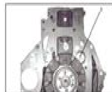
Fig. 7 1. Crank