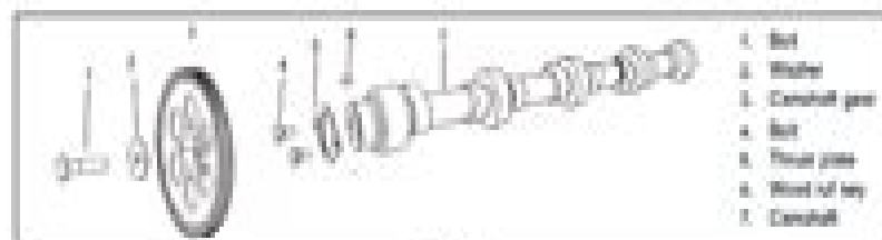
Fig. 4 Crankshaft Assembly