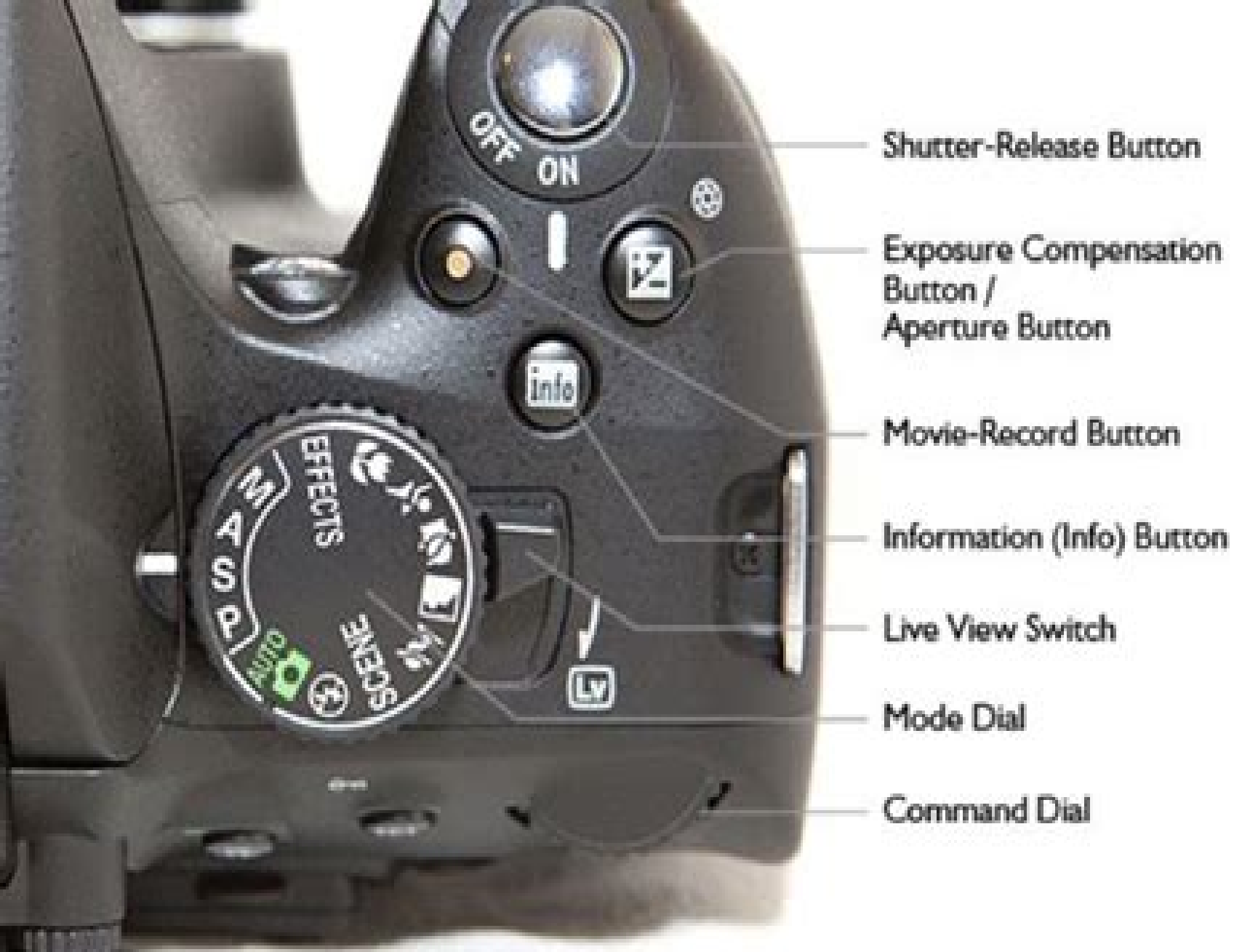
Figure 2 - Controls on the top of the D5100