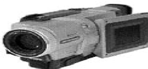
Photo : DCR-TRV730E RMT-814