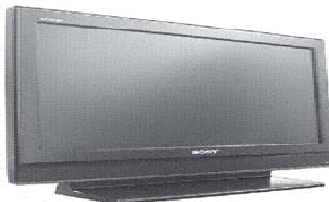
KDL-26U3000 / KDL-32U3000 / KDL-37U3000 / KDL-40U3000