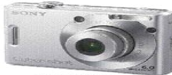
Photo : DSC-W30/Silver.