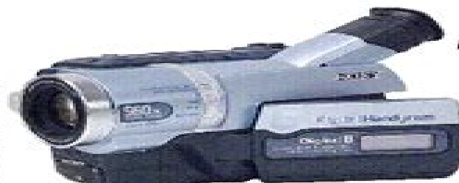
Photo : DCR-TRV140E