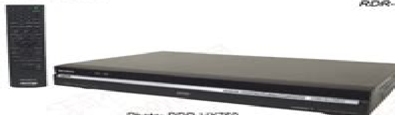
Photo: RDR-HX750 RMT-D247P