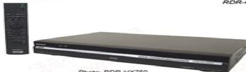
Photo: RDR-HX750 RMT-D247P