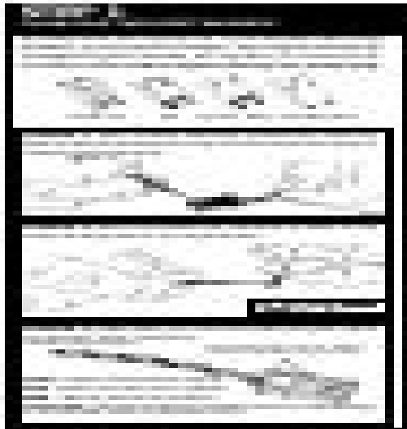
Figure 6: A line graph showing the relationship between the number of people (N) and the number of people (N). The x-axis is labeled 'Number of people (N)' and the y-axis is labeled 'Number of people (N)'. The graph shows a curve that starts at the origin and increases, with a label 'N' near the curve.

Figure 4: A line graph showing the relationship between the number of people (N) and the number of people (N). The x-axis is labeled 'Number of people (N)' and the y-axis is labeled 'Number of people (N)'. The graph shows a curve that starts at the origin and increases, with a label 'N' near the curve.