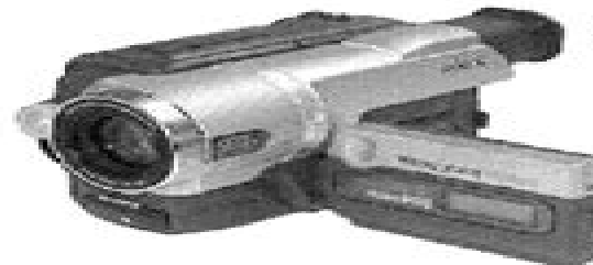
Photo : CCD-TRV408E

AEP Model UK Model East European Model North European Model Russian Model CCD-TRV108E/TRV208E/TRV408E E Model Australian Model Hong Kong Model Tourist Model CCD-TRV107E/TRV408E Chinese Model CCD-TRV107E