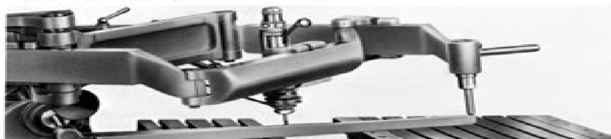
Fig 4 Aligning cutter and tracer pin with straightedge attachment