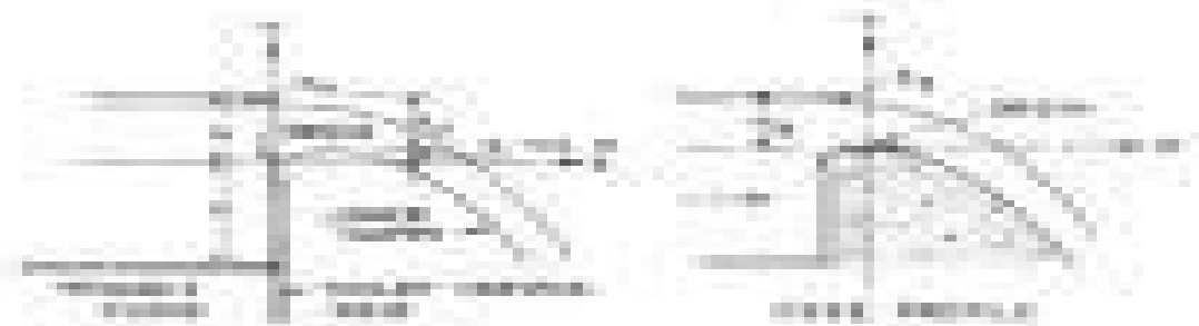
Figure 1. Operation of Chisel or Overflow spillway.

This type of overflow spillway is the most common type of spillway in use in the world and that is Chisel or Overflow spillway. It is a gravity structure supported by foundation and spillway gate located in the crest over structure.