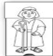
Paper Sack Puppet