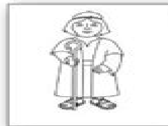
Flannel Board Figure