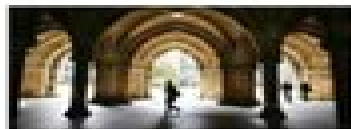
University Justice for Palestine Society (UJPS) had left Jewish students in Glasgow "expressing fear, distress, and disbelief".