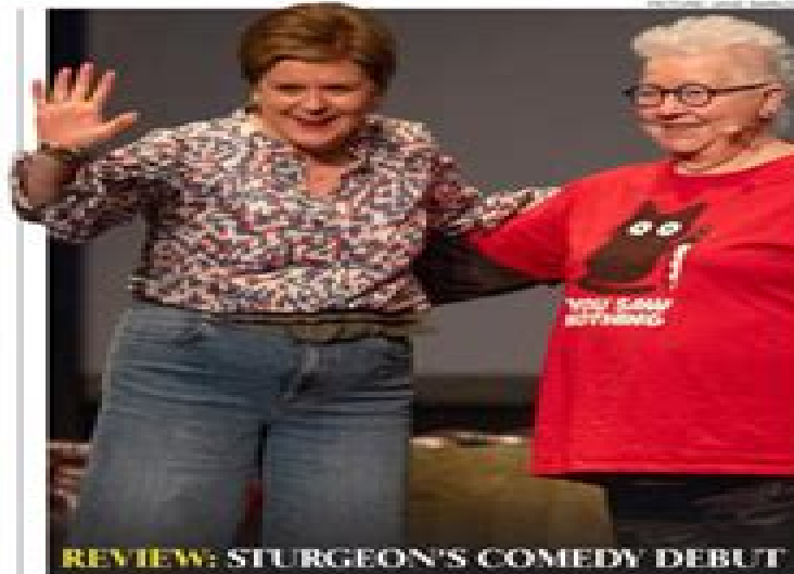
REVIEW: STURGEON'S COMEDY DEBUT