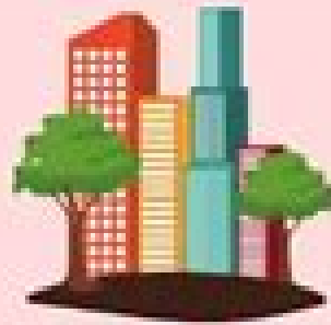
Land & Buildings