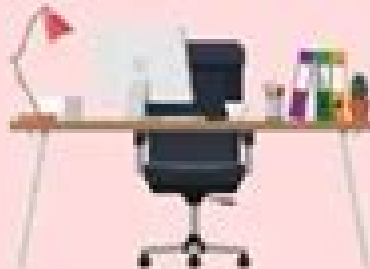
Desks & Chairs