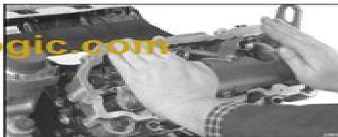
Figure 253 Seating the high-pressure oil rail