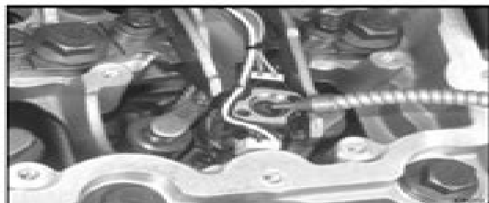
Figure 251 Lubricating top D-ring

CAUTION: To prevent engine damage, be sure injector wiring is clear of all moving parts.