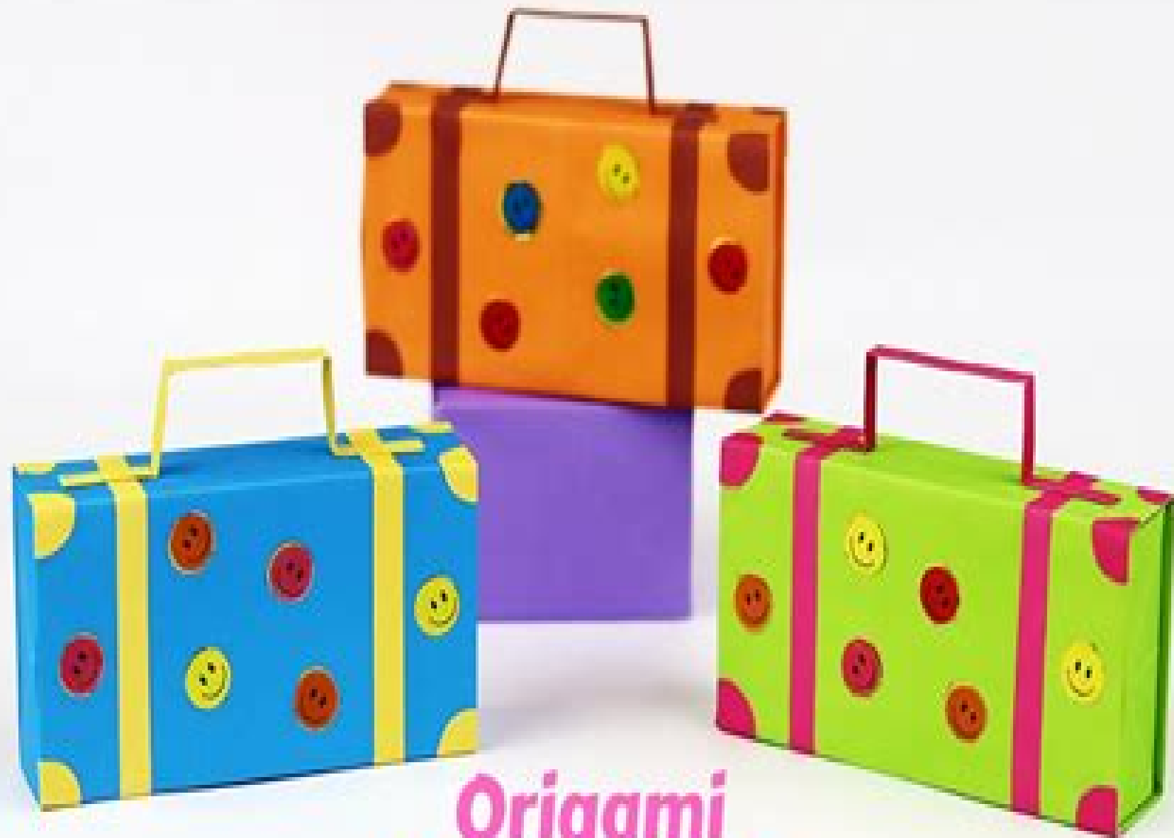
Origami Suitcase Gift Box