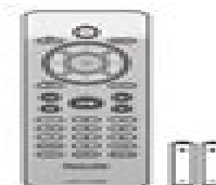
Remote Control and 2 AAA batteries