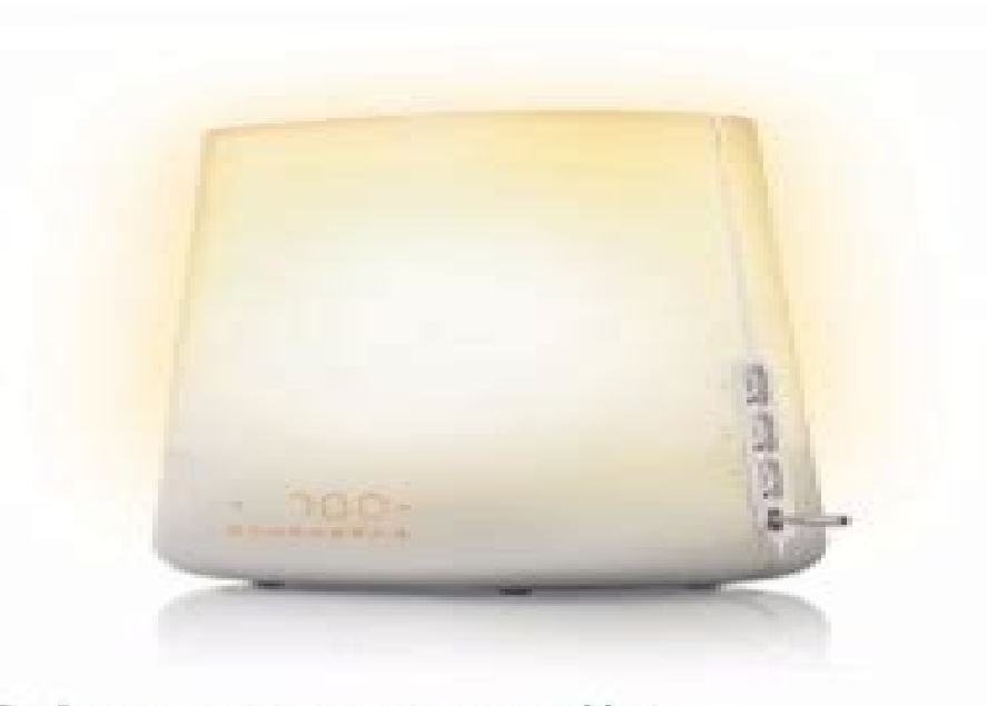
Philips Wake-up Light