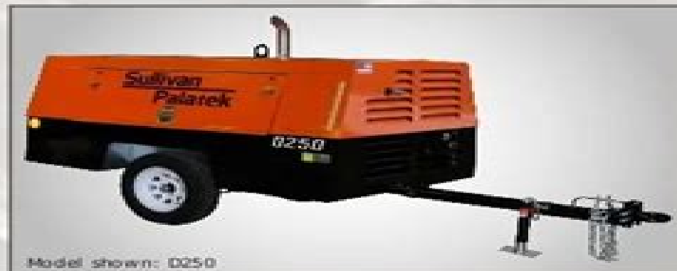
Model shown: D250

Operating costs are significantly reduced because our compressors can be sized to desired operating conditions.