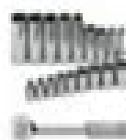
SocetSet and Leica ADS40