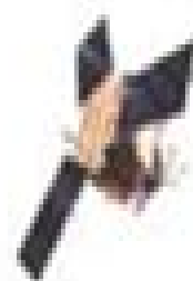
Space Imaging IKONOS RPC