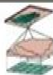
Orthophoto Feature Collection