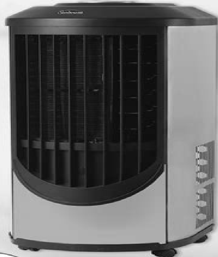
Model #KY-25/Y: 9000 BTU PORTABLE DIGITAL AIR CONDITIONER STAINLESS STEEL ACIER INOXYDABLE ACERO INOXIDABLE