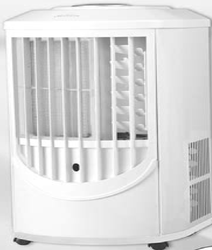
Model #KY-25/Y: 9000 BTU PORTABLE DIGITAL AIR CONDITIONER WHITE METAL METAL BLANC METAL BLANCO