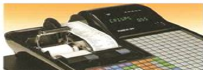
'Drop-in' paper loading mechanism helps users to change paper instantly.