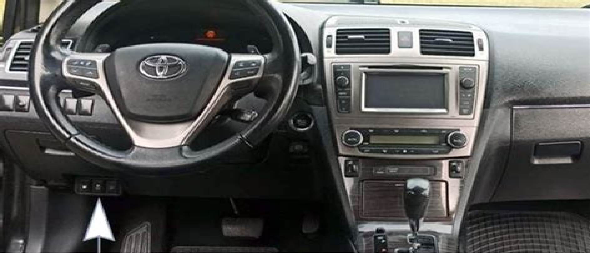
Instrument Panel Fuse Box