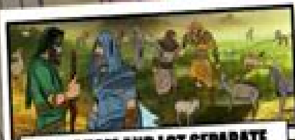
ABRAHAM AND LOT SEPARATE

FREE PRINTABLE BIBLE LESSON FOR PRETEENS & TEENS