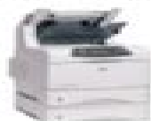
HP LaserJet 4250dtn/a y HP LaserJet 4350dtn/a

Para usuarios de oficina en grupos de trabajo de 10-20 personas en empresas grandes, medianas y pequeñas, las impresoras HP LaserJet series 4250/4350 ofrecen los medios para aumentar la productividad y satisfacer las exigencias de rendimiento con una solución rápida, fiable, ampliable y fácil de usar.