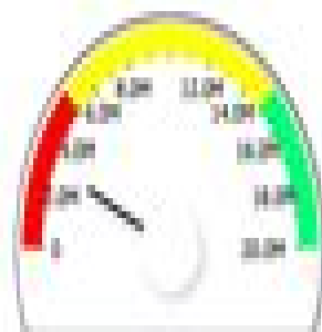
Real-Time Total Sales (Current 1 Hour)