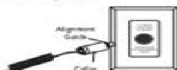
Figure C. Plugging Programmer into Wall Jack

Noting placement of alignment guide, plug your Programmer's connector into the wall jack (Figure C). The connector is self-locking and should click into place.