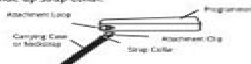
Figure B. Carrying Strap Connection