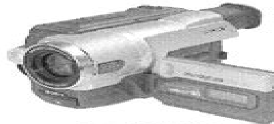
Photo : CCD-TRV408E

AEP Model UK Model East European Model North European Model Russian Model