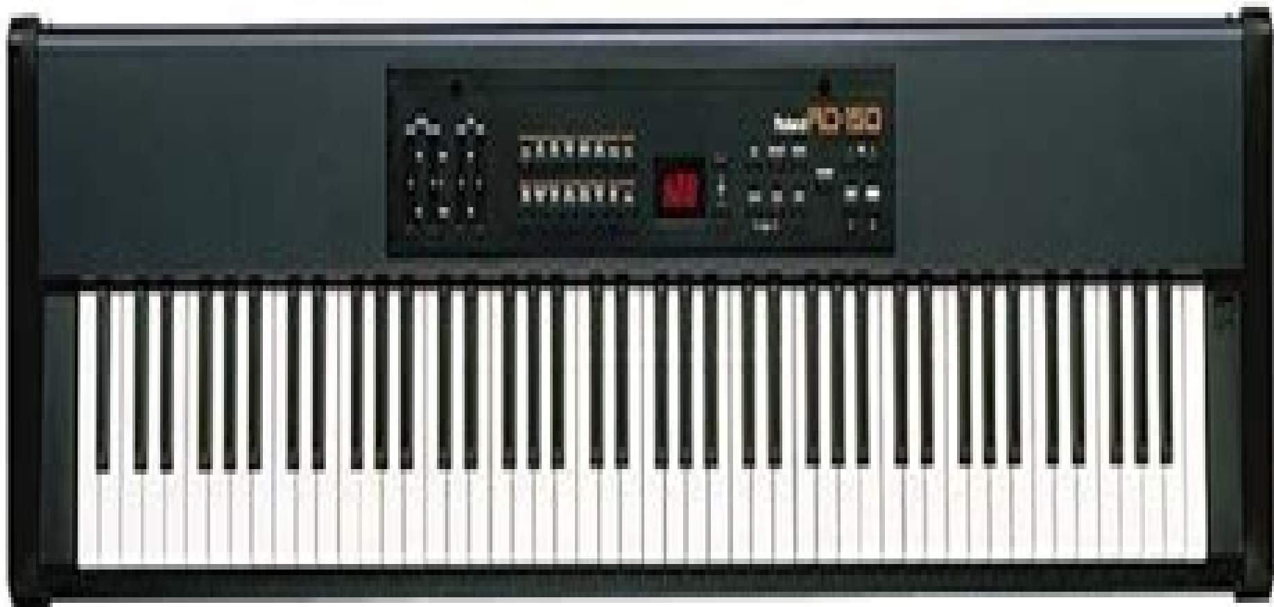
Figure 1: Front view of the Roland RD-150 digital piano.