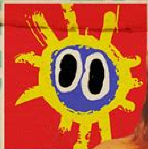
The Brian Jonestown Massacre