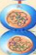
Telophase I & Cytokinesis I

Nuclear envelopes reform. Two haploid daughter cells are formed.