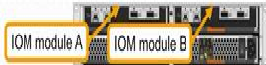
IOM module A