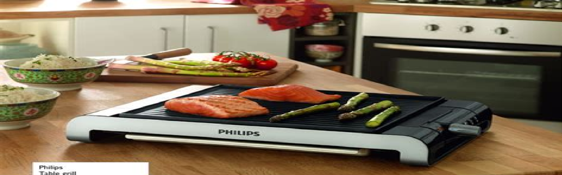
Philips Table grill