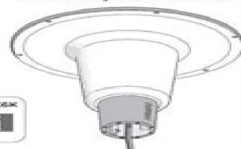
BDS 490 Citycharm Cordoba